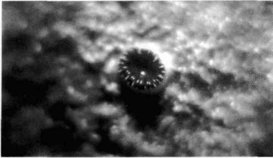
Fig. 2. Favia polyp settled on a tile

i.e., 22 cm 2 of substrate (individual polyp 4 mm dia.) (Fig.2). Other major fouling organisms settled on the tiles were barnacles, oysters, coralline algae and serpulids.