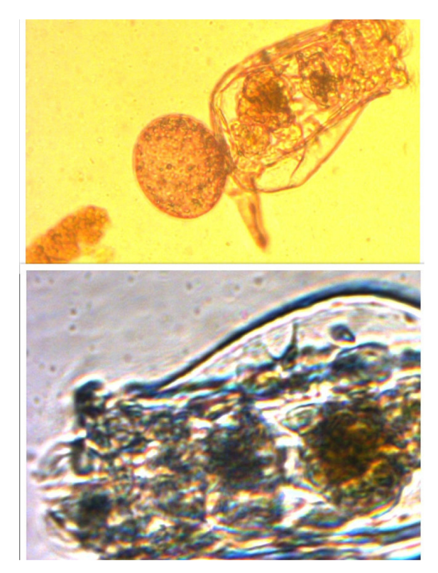
inoculation in culture tanks. A decrease in Vibrio count and increase in the density with increase of probiotic loads and in the mass culture tanks of copepod and rotifers supplemented with probiotic enriched diets. The total bacterial loads and ammonia levels of water in copepod tanks decrease in probiotic treated tanks and eliminates Vibrios from tanks fed with marine microalgae supplemented with probiotics.

The density of copepod nauplii increase significantly (2.4 times) in tanks supplemented with probiotics. Water quality of live feed culture systems also improve with probiotic