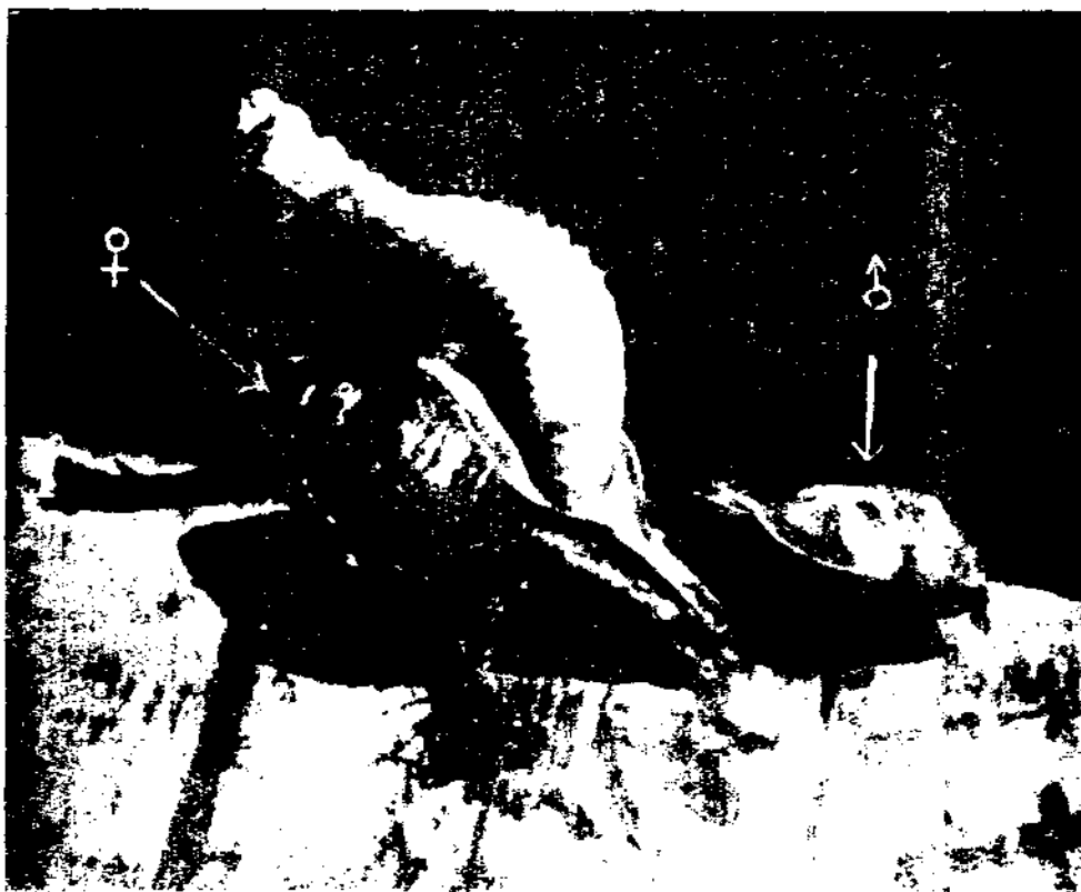
PHOTOGRAPH 1. Male and female chank which had copulated. The egg capsule with the base extruded first may be noted.

Thomas (1884) and Hornell (1921) have stated that the sexes are separate and that the females are larger than the males. Observations now have confirmed this. The females were the larger of the copulating pair. In many cases they were one and a half times more than the diameter of the males (Photograph 1). The globose female was surrounded by, in majority of the cases, four to five males of smaller size (Photograph 2). There were instances when there was only one male. The