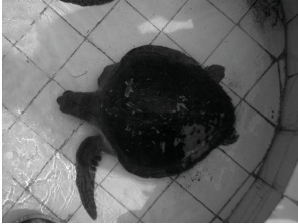
Figure 1: Turtle I - that was found stranded at Juhu.