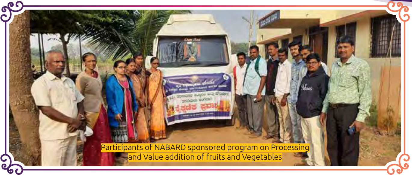
Participants of NABARD sponsored program on Processing and Value addition of fruits and Vegetables

UAS Raichur, Future Greens NGO, CEDOK Bijapur, Laxmi Sai Fig processing unit, Bellary, NABKisan, highlighted on the methods and technologies for processing and value addition to fruits and vegetables, Post-harvest handling of fruits and vegetables, Labelling and branding, Bankable project report preparation, Horti-prenuer development, Availing loans through banks, management of stored products for extended shelflife, hands on training experience on BAKAHU preparation, baked products, Drumstick value addition, preparation of lime powder, RTS and juice, fruit bars and lather, Jam and Pickling was done. As a part of training two days exposure visit was organised from 10.02.2022 to 11.02.2022 to fruit and millet processing laboratory, UAS Raichur, Pesticide Residue laboratory, UAS Raichur, Processing industries, Fig processing industry, Kurugod, Bellary. During closing ceremony program on 12.02.2022, a folder on Value addition to banana was released. Closing ceremony, Folder release and certificate distribution of Nabard sponsored 7 days