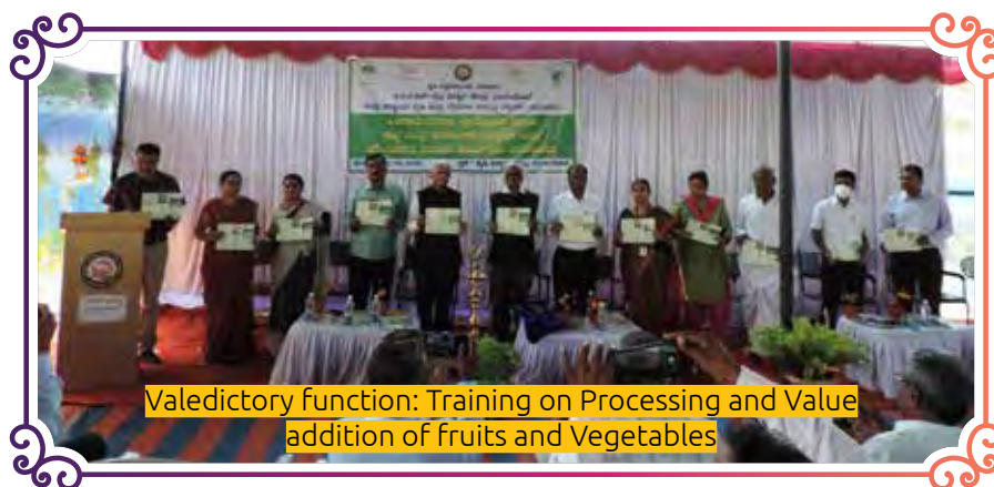
Valedictory function: Training on Processing and Value addition of fruits and Vegetables

NABARD sponsored seven days (07.02.2022-13.02.2022) training program on Processing and Value addition of fruits and Vegetables to 25 FPO members of Bagalkot district was inaugurated on 07.02.2022 at KVK Bagalkot. Eminent speakers from UHS, Bagalkote, UAS Dharwad,