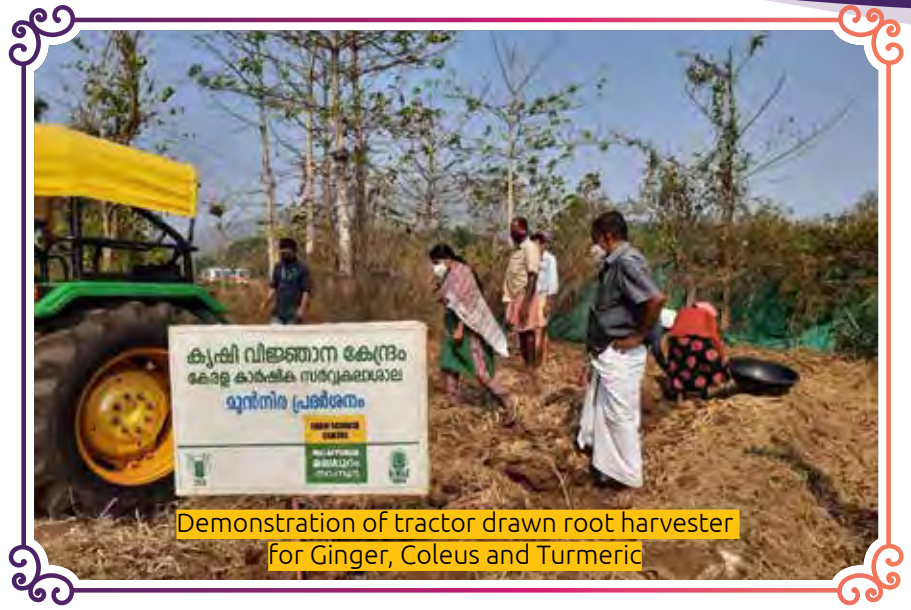
Demonstration of tractor drawn root harvester for Ginger, Coleus and Turmeric

in harvesting of ginger, coleus and turmeric demonstration was