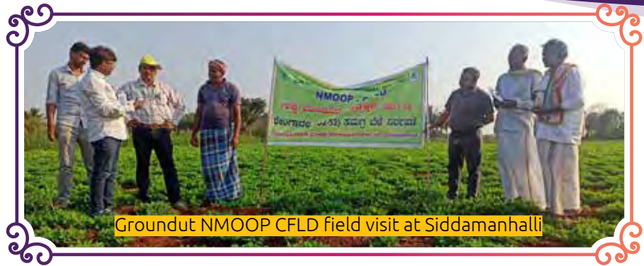
Groundnut NMOOP CFLD field visit at Siddamanhalli