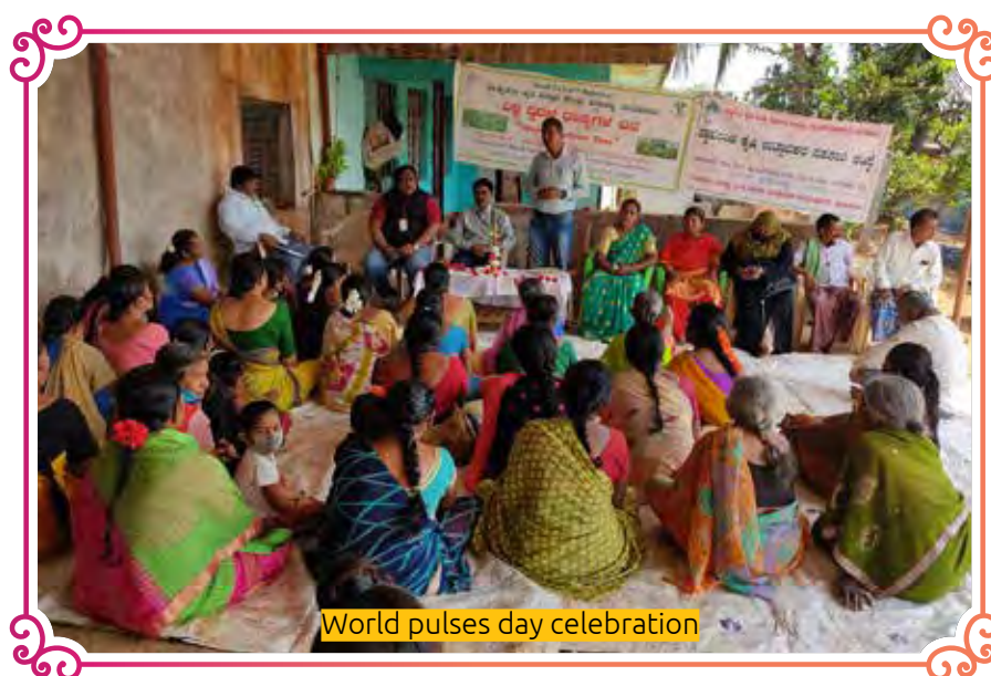
World pulses day celebration

World pulses day was celebrated on 10th Feb,2022 by ICAR-KrishiVigyan Kendra, Hirehalli, Tumakuru-2 in collaboration with the Swavalambi Farmers, Producers Organization at BukkapattanaHobli in Sira Taluk in the district. During the oc-