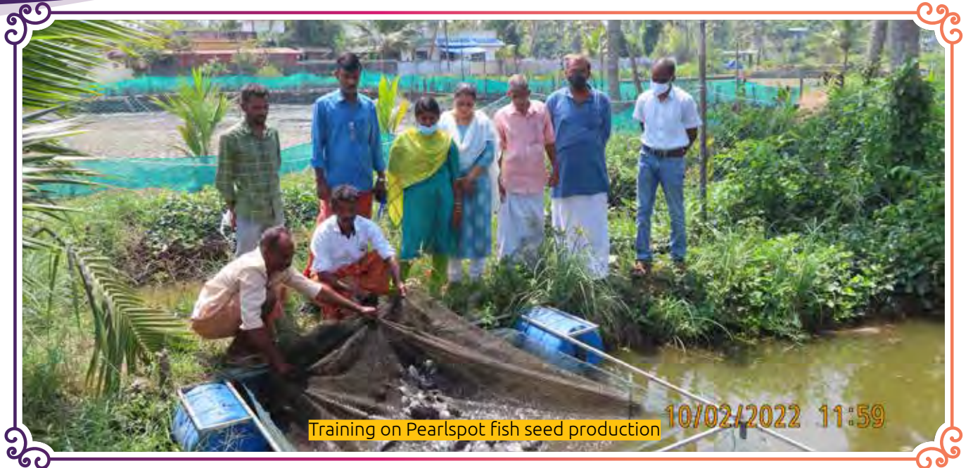
Training on Pearlsport fish seed production