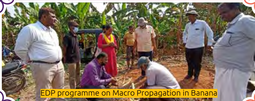
EDP programme on Macro Propagation in Banana

To encourage the entrepreneurship development of among the farmer as a rural youth KVK has conducted EDP programme on macro propagation in Banana. In this EDP two days capacity build-