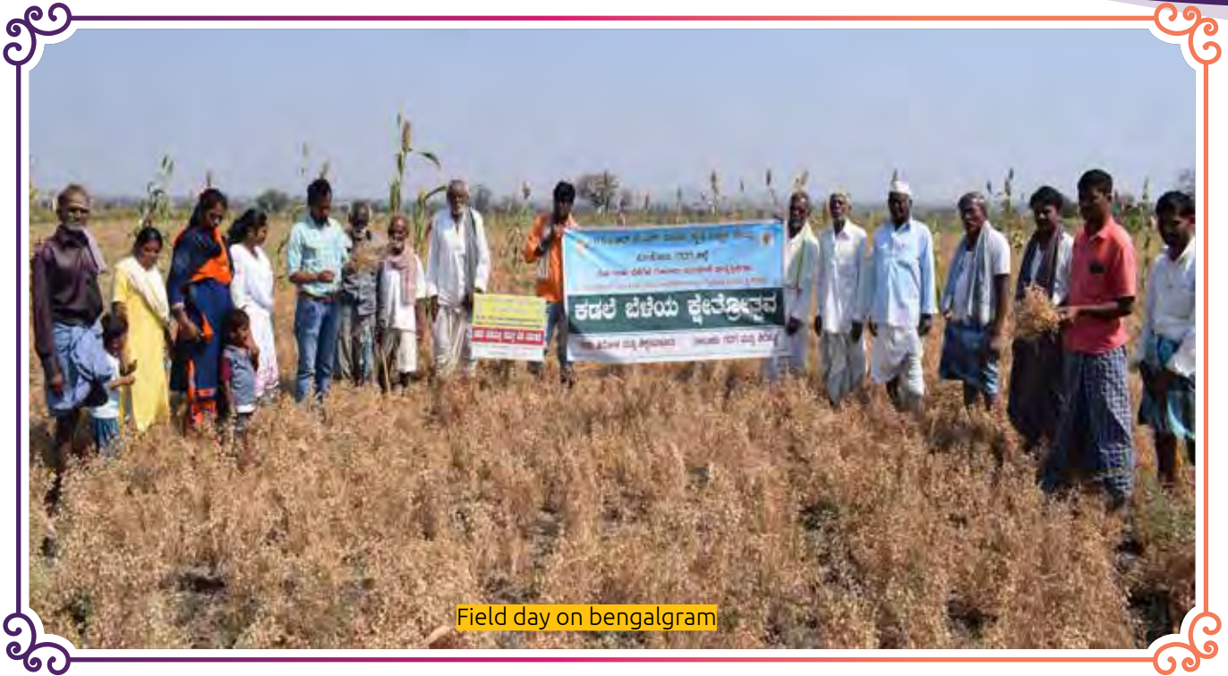
Field day on bengalgram