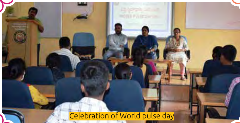
Celebration of World pulse day

February as World Pulses Day (WPD). This celebration presents a unique opportunity to raise public awareness about pulses and the fundamental role they play in the transformation