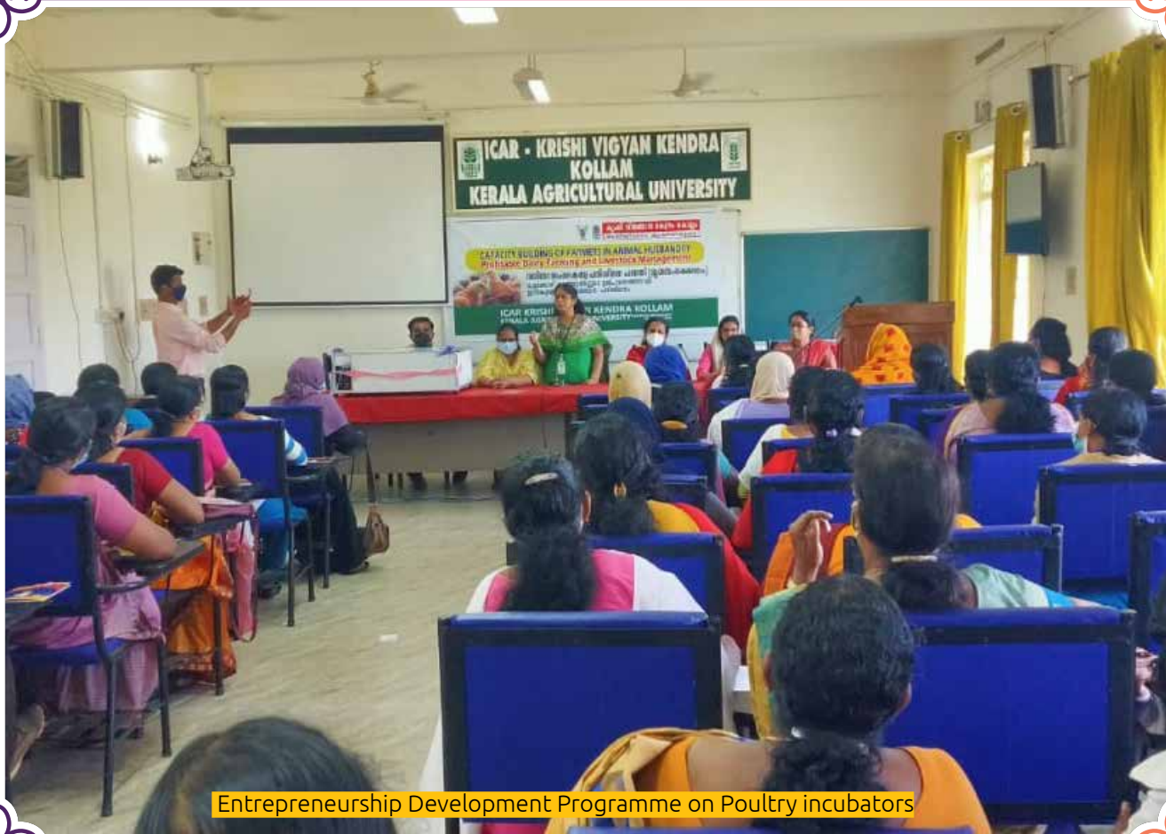
Entrepreneurship Development Programme on Poultry incubators