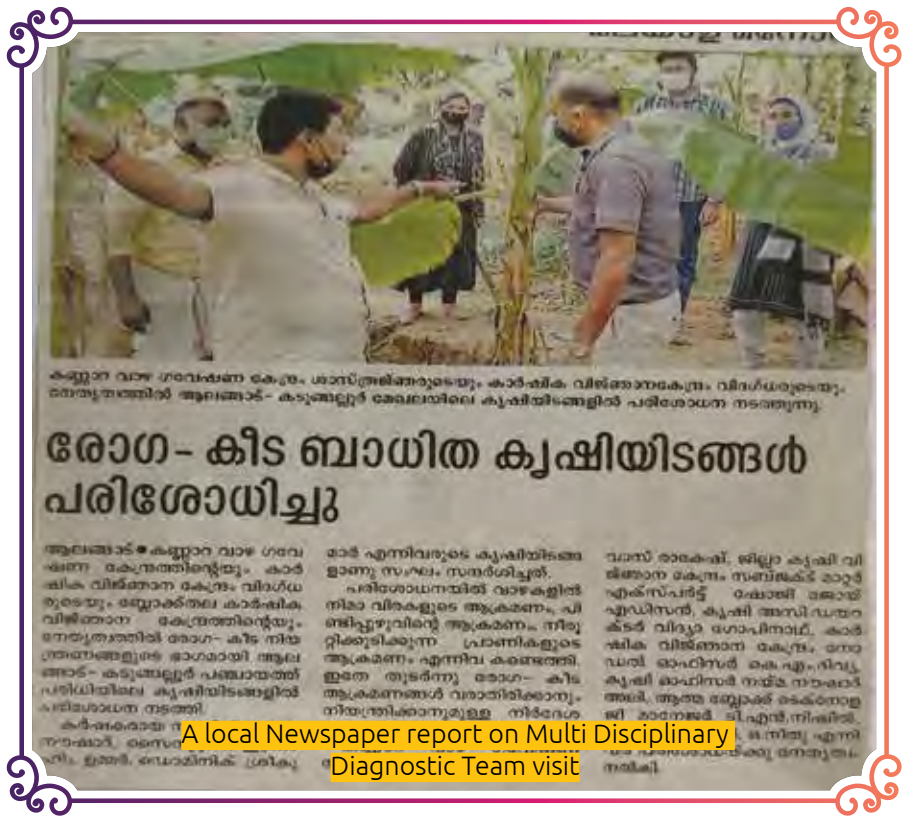
A local Newspaper report on Multi Disciplinary Diagnostic Team visit