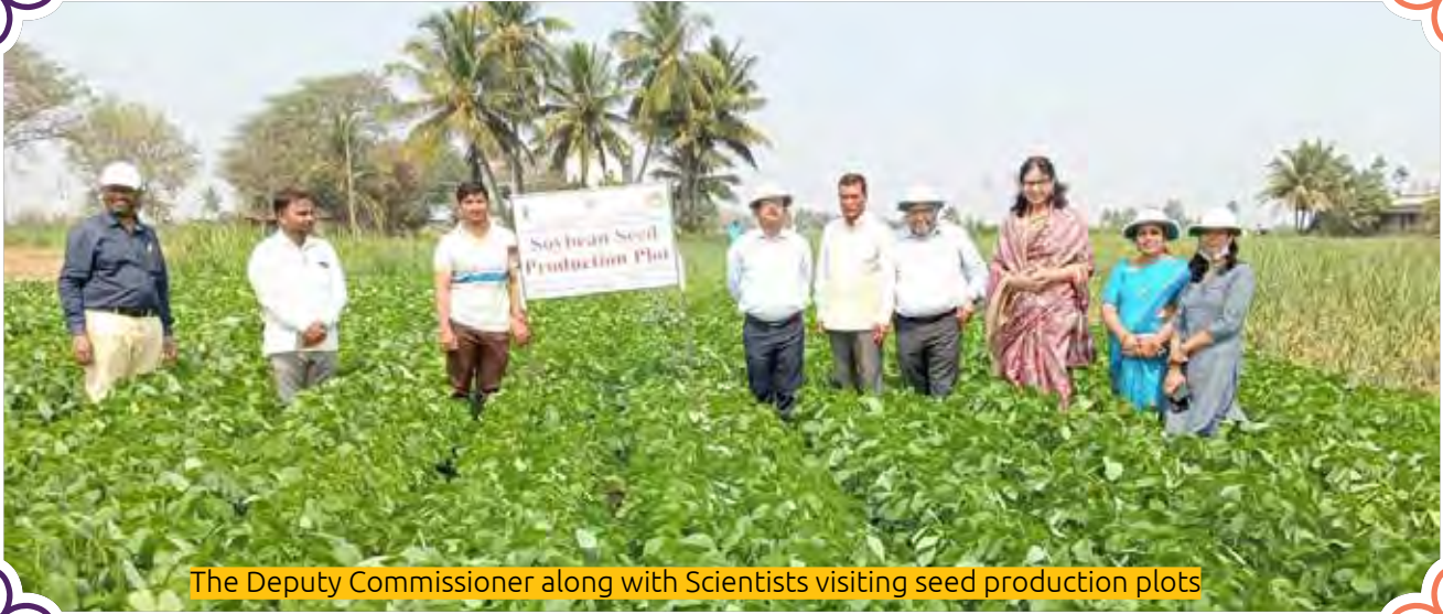
The Deputy Commissioner along with Scientists visiting seed production plots

officials and Scientists expressed their happiness over the performance of new varieties and appreciated the lead being initiated by KVK under the guidance of Dr.R.R. Hanchinal for large scale production of soybean seeds enabling the efforts of Government of India to provide quality seeds to Karnataka and other states of India to meet self-sufficiency in oil seed production in the country.