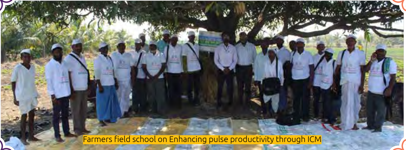
Farmers field school on Enhancing pulse productivity through ICM