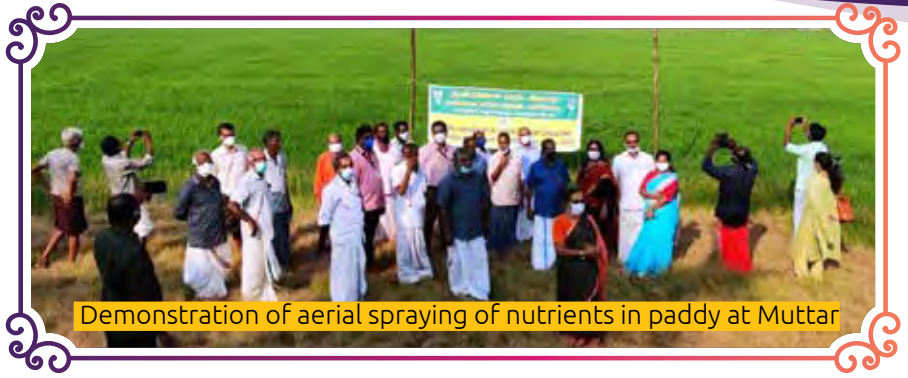
Demonstration of aerial spraying of nutrients in paddy at Muttar

Use of drones (UAV) for large scale aerial spraying of nutrients was demonstrated in a total of 175 acres of paddy fields in three villages viz., Edathua, Muttar, and Puliyyur by KVK-Alappuzha in the first fortnight of February. The technology demonstrations in Edathua and Muttar villages of Kuttanad region, a unique wet land ecosystem of below sea level farming, were covered under the NICRA project where a package of climate resilient technologies were demonstrated to paddy farmers. The package included high yielding short duration paddy variety 'Manurathna', sowing of seeds using drum seeder, soil test based nutrient