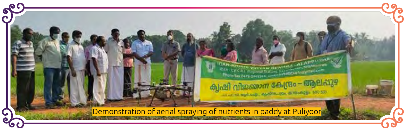
Demonstration of aerial spraying of nutrients in paddy at Puliyoor