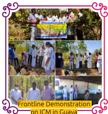
Frontline Demonstration on ICM in Guava