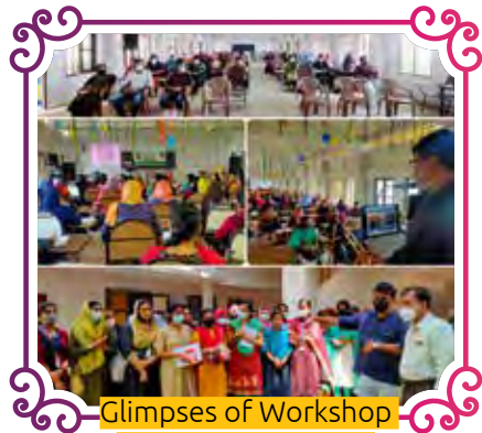
Glimpses of Workshop for teacher trainees

in harvesting of ginger, coleus and turmeric demonstration was