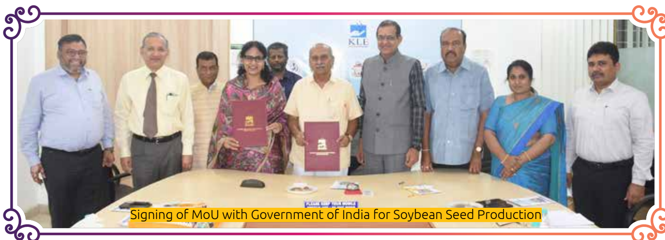
Signing of MoU with Government of India for Soybean Seed Production