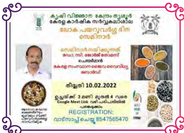
World Pulses day flyer