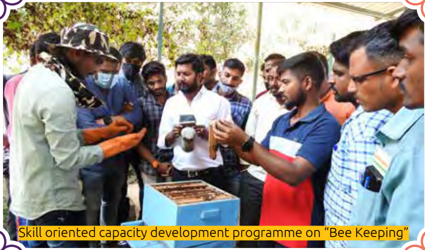
Skill oriented capacity development programme on "Bee Keeping"