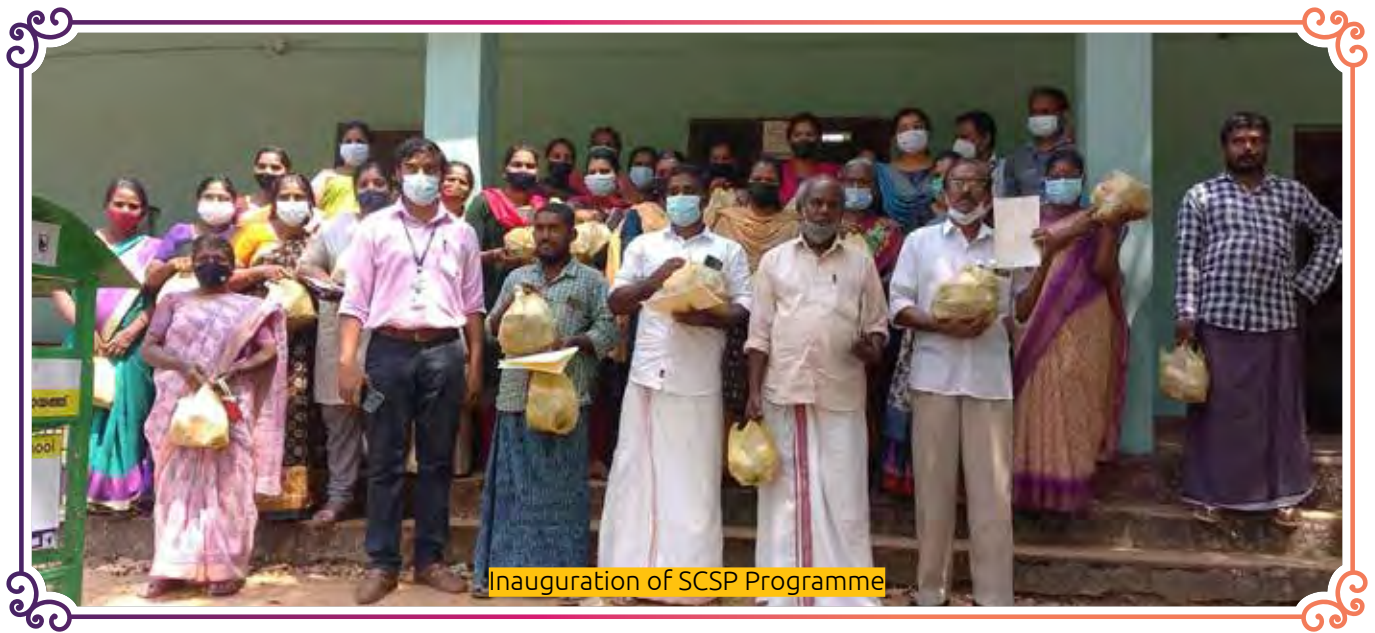
Inauguration of SCSP Programme

done with a tractor drawn root harvester developed by Kerala Agricultural University. The main problem faced by Ginger, Coleus and Turmeric farmers is scarcity of farm power, high cost of labour and unavailability of timely labour during sowing and harvesting. The hilly terrain and moisture condition in soil make this situation worse. The parameters like field capacity and damage loss etc. were noted as part of this demonstration.