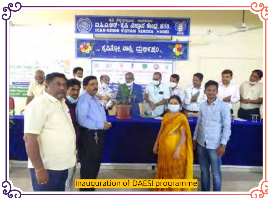
Inauguration of DAESI programme