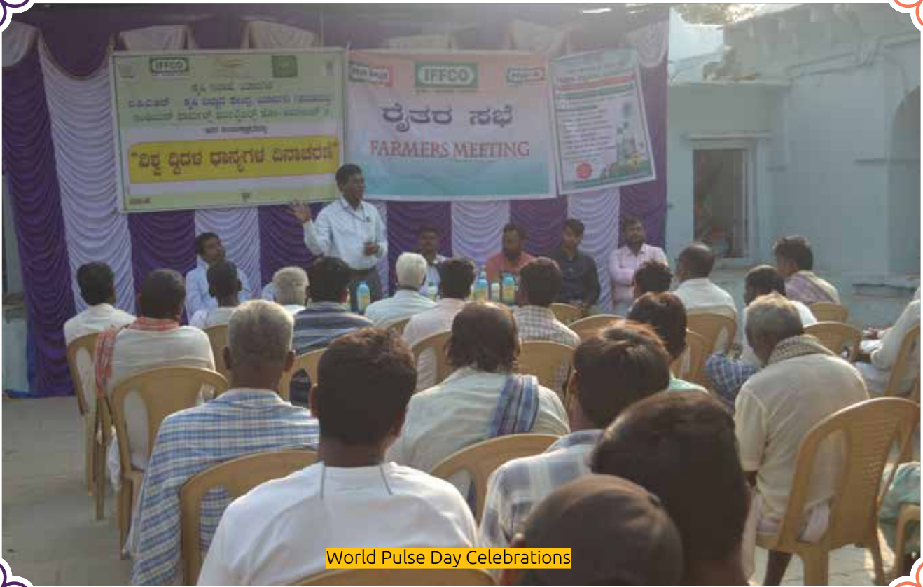
World Pulse Day Celebrations