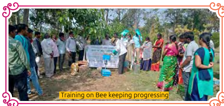
Training on Bee keeping progressing