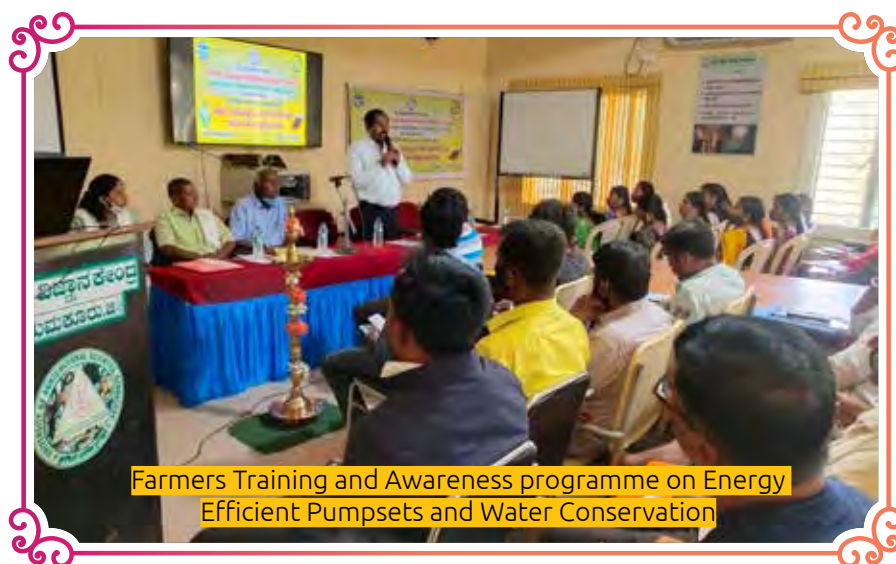
Farmers Training and Awareness programme on Energy Efficient Pumpsets and Water Conservation