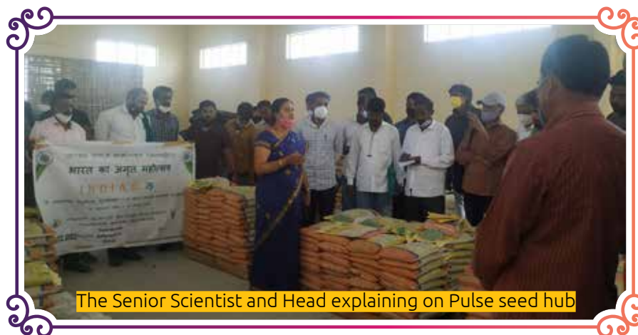
The Senior Scientist and Head explaining on Pulse seed hub