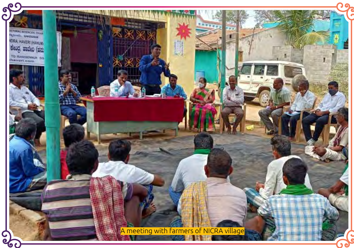
A meeting with farmers of NICRA village