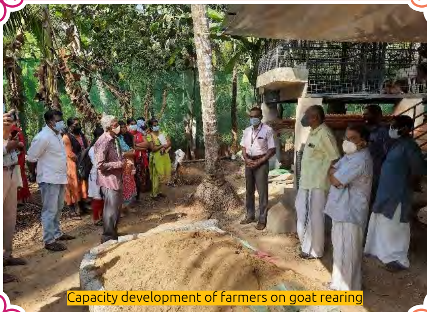
Capacity development of farmers on goat rearing

KVK conducted three days training on Goat rearing as part of the capacity development of farmers on profitable dairying and livestock management from 9th to 11th February, 2022.