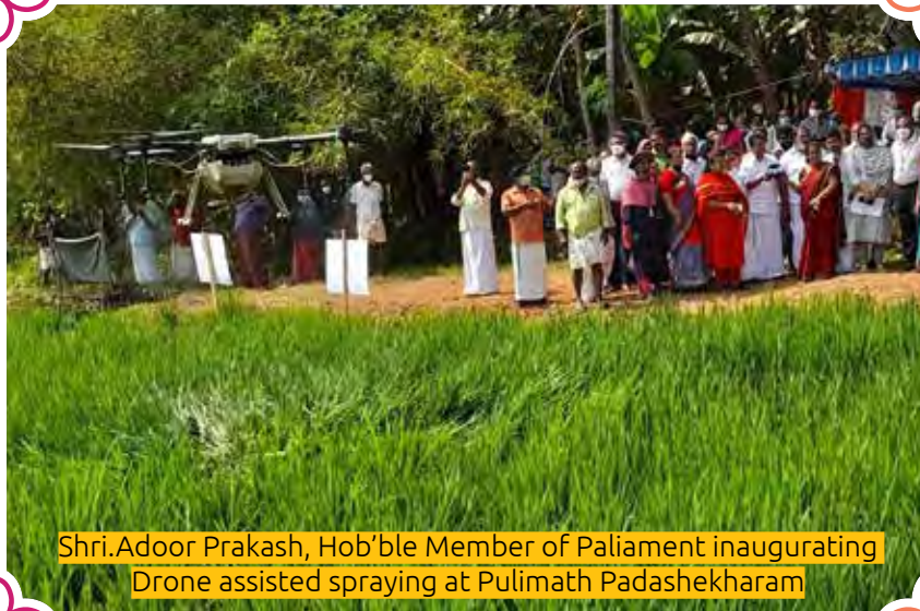
Shri.Adoor Prakash, Hob'ble Member of Paliament inaugurating Drone assisted spraying at Pulimath Padashekharam

ICAR –KVK, Thiruvananthapuram had demonstrated the use of Agricultural Drones at two