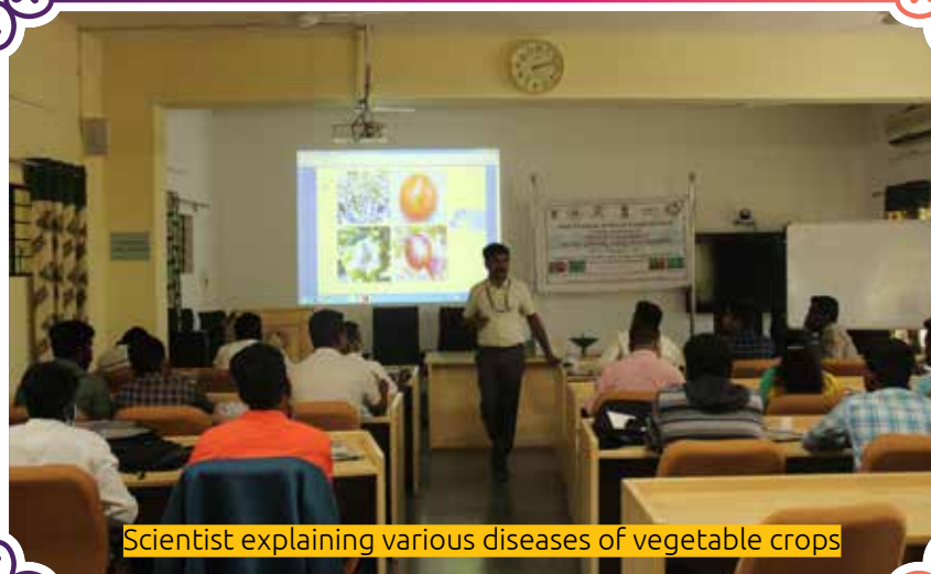
Scientist explaining various diseases of vegetable crops

In this programme the trainees gained the knowledge about Pest and disease resistant varieties in vegetables, Role of nutrients in vegetables in relation to pest & disease management, Pesticide residual analysis in vegetable crops and Integrated management of fruit flies in vegetables etc.