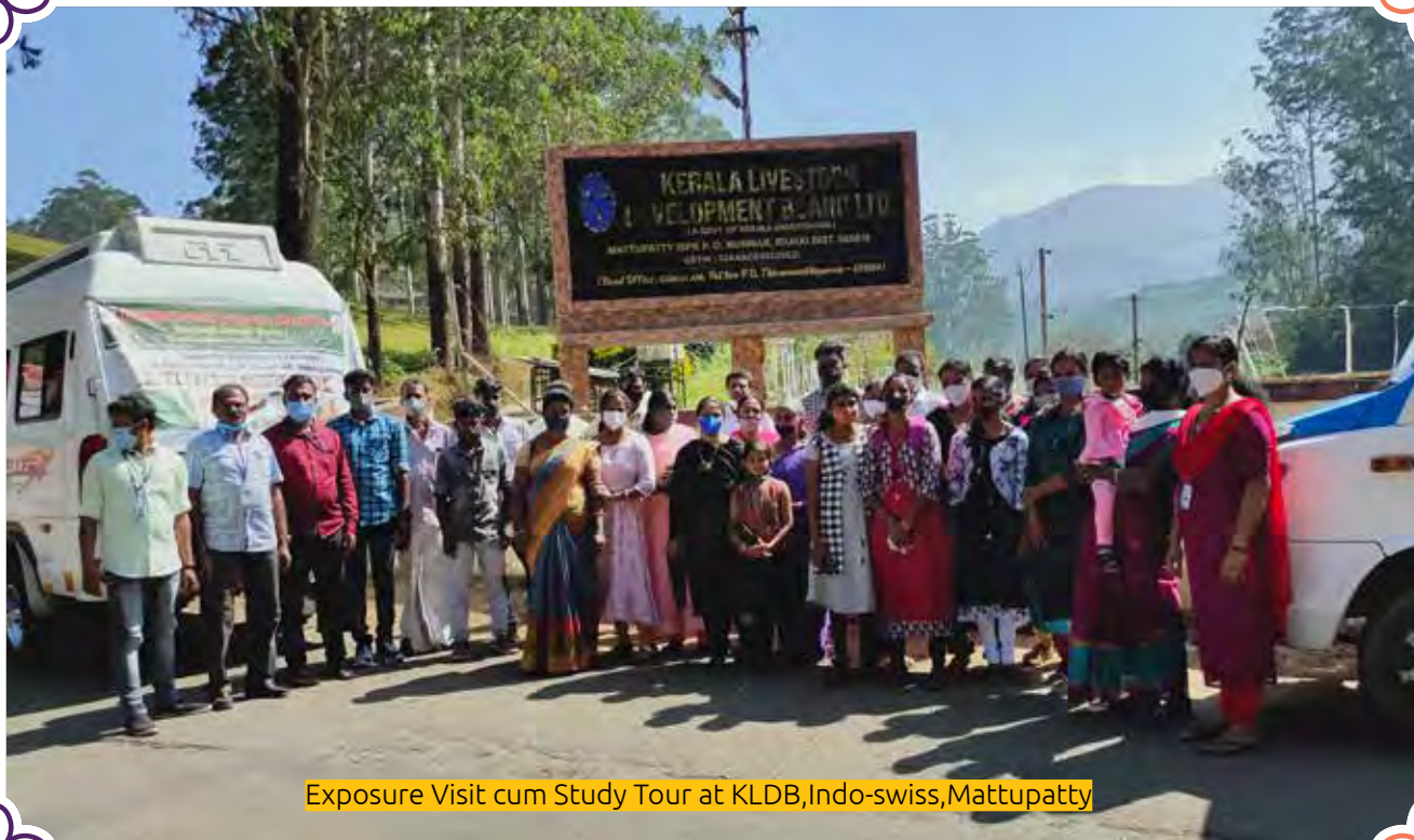
Exposure Visit cum Study Tour at KLDB, Indo-swiss, Mattupatty