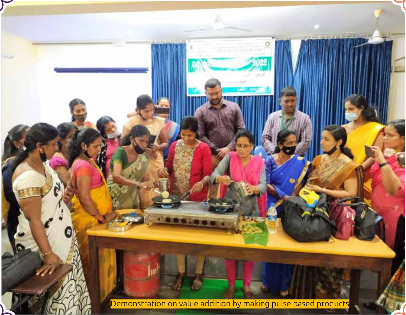
Demonstration on value addition by making pulse based products