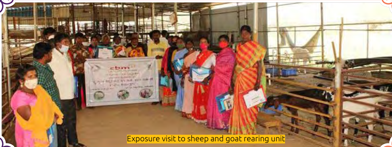
Exposure visit to sheep and goat rearing unit