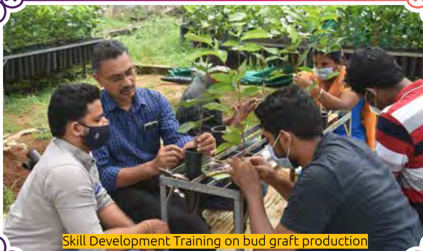
Skill Development Training on bud graft production

The conventional system of raising seedlings in nurseries is the polybag growing system. The drawback of this system is associated with high cost of production due to heavy labour dependence and potting mixture requirement. The polybag growing system also causes root restriction and root coiling which reduce the seedlings growth and lower field survival rate upon field transplanting. In order to solve this issue and to significantly enhance the quality of the bud grafted plants of Jack fruit and Rambutan, KVK, Pathanamthitta initiated