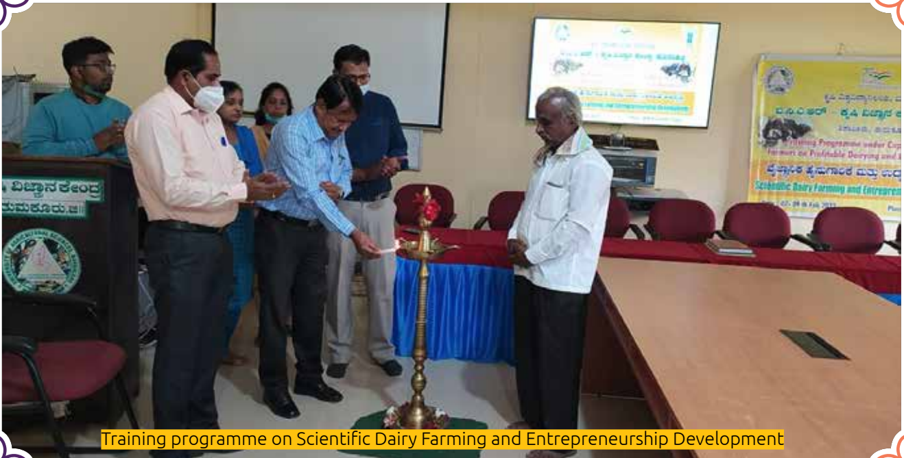
Training programme on Scientific Dairy Farming and Entrepreneurship Development