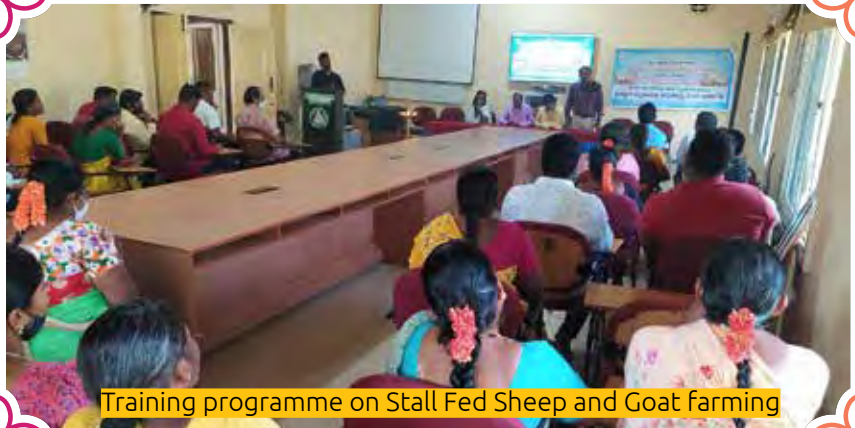
Training programme on Stall Fed Sheep and Goat farming