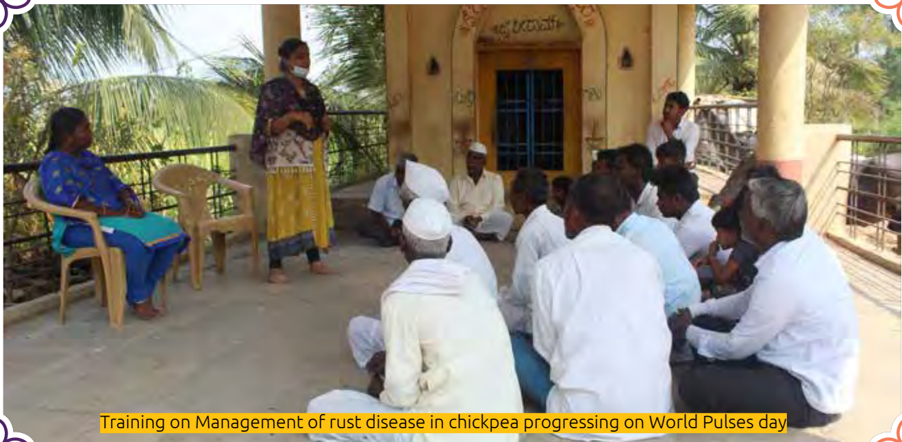
Training on Management of rust disease in chickpea progressing on World Pulses day