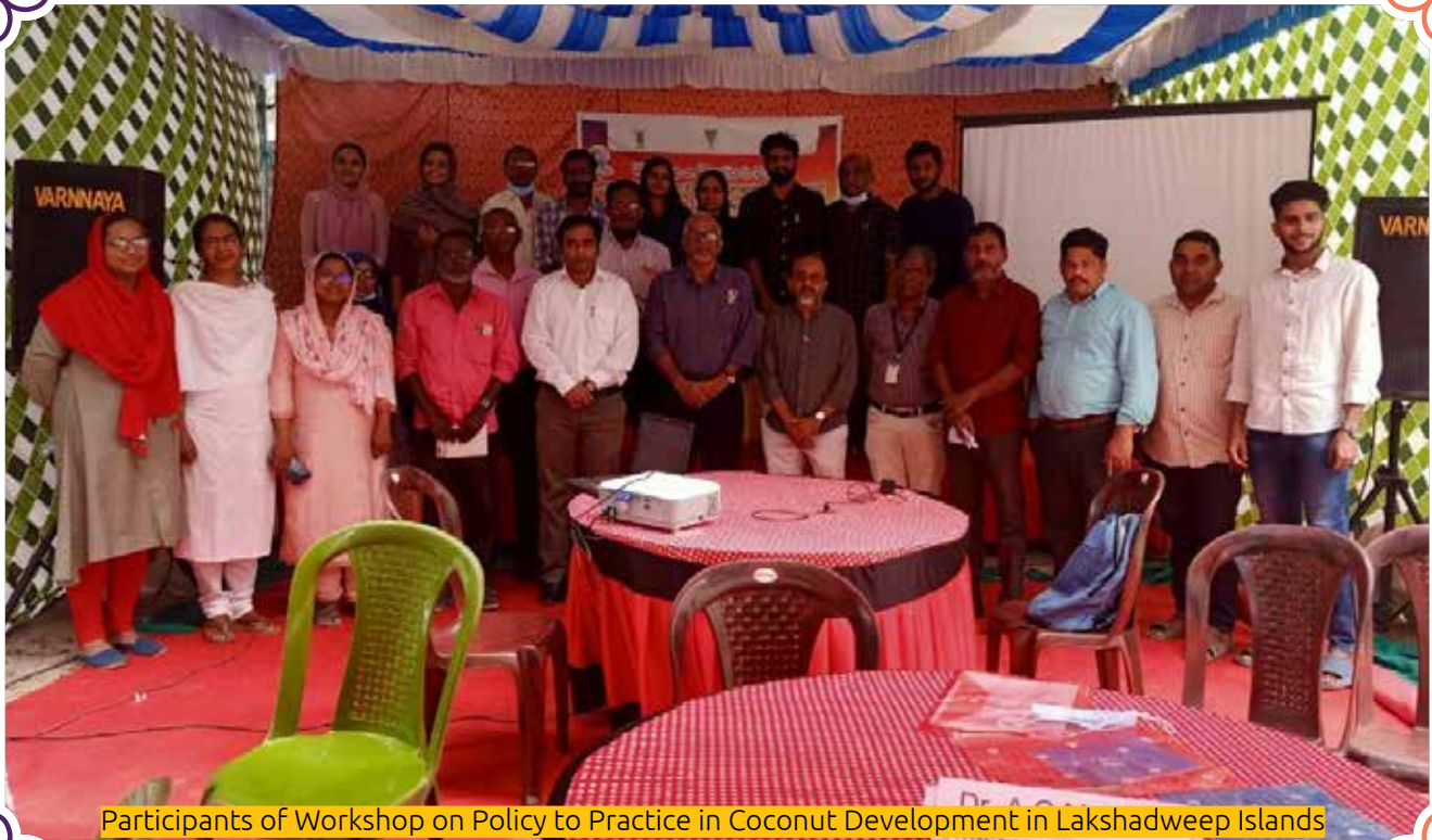
Participants of Workshop on Policy to Practice in Coconut Development in Lakshadweep Islands