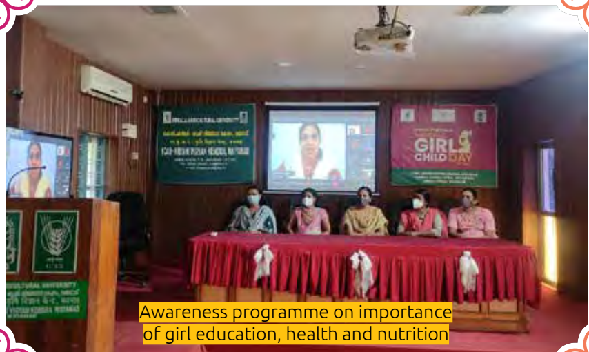
Awareness programme on importance of girl education, health and nutrition

KVK Wayanad conducted an Awareness programme on "Importance of girl education, health and nutrition" as part of National Girl Child Day. 57 girl students from VHSE Ambalavayal and Thalipparamb participated in the programme. Wel-