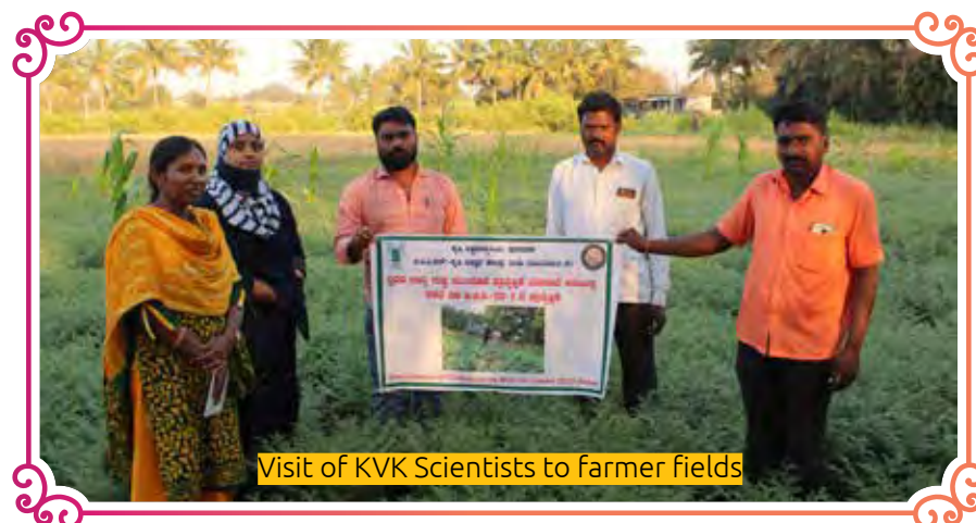
Visit of KVK Scientists to farmer fields