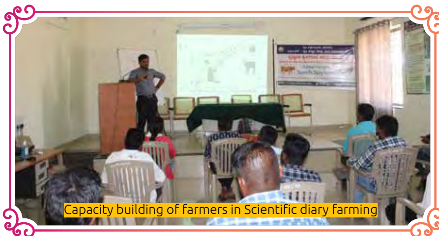
Capacity building of farmers in Scientific diary farming

Scientific diary farming under capacity building of farmers on profitable diary farming from 07.02.2022 to 09.02.2022 at