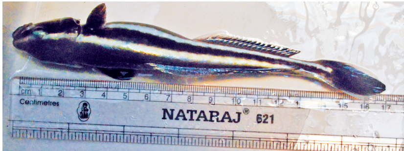
Two months old cobia fingerlings