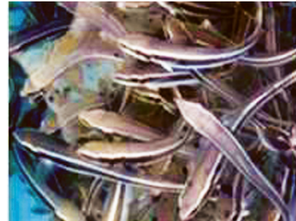
Fingerlings ready for stocking in grow out cages