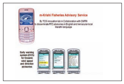
m-KRISHI®-Fisheries mobile service

ensures economic benefits to the stakeholders by enabling them to find Potential Fishing Zone areas directly. Images, Text, Voice, Query, Feedback & other services are integrated in the facility and it is available in local Marathi and English languages. Early Warning System (EWS) is also coupled with the mobile service and has been updated to generate advisories 5 days in advance. Oceanic wind speed and direction advisories generated from INCOIS website are displayed four times daily. The service also provides regional wind speed and direction advisories generated from IMD website daily