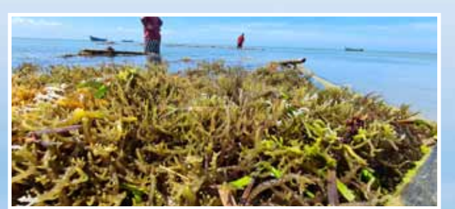
Raft ready for harvest (Crop period - 45 days)

Floating bamboo raft method is ideal in locations which are calm and shallow . The floating raft is made