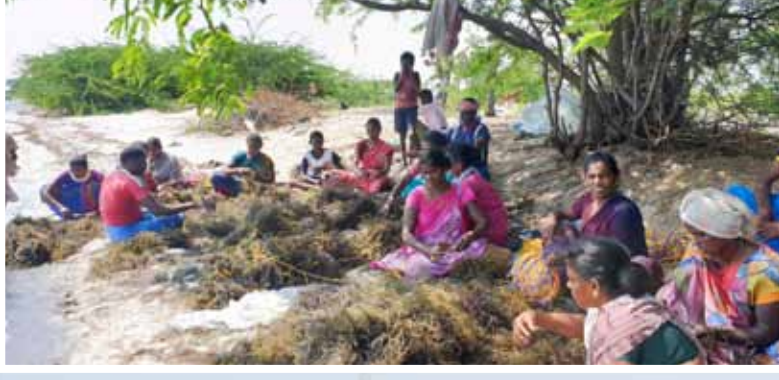
Seeding the rope @ 150 grams per tie