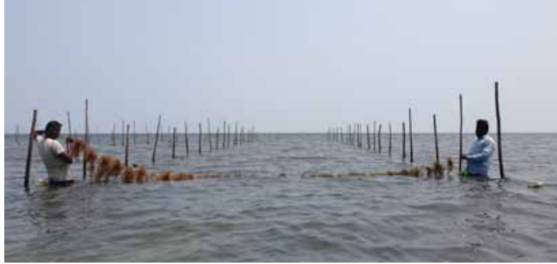
Seeded ropes tied on the pole