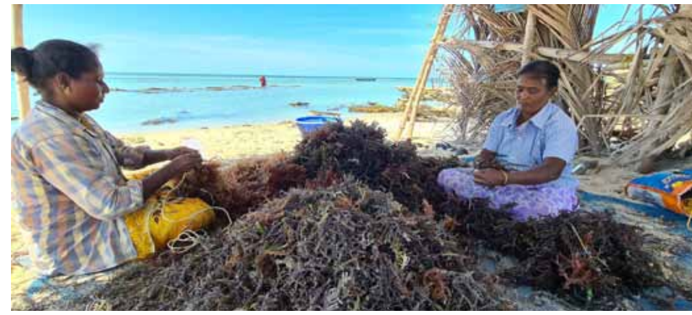
Tying the seed