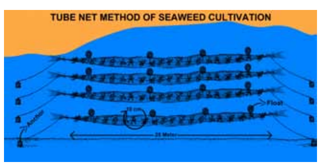
Tube Net method of Seaweed cultivation

The tube net method can be adopted in locations with higher wave action in coastal states like Andhra Pradesh and Gujarat. The tube nets (10 cm diameter; mesh size of 1.5 cm) of 25 m length are held floating in the water column below the surface with