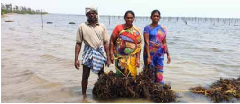
Ropes ready for harvest after 45 days

In locations characterized by moderate wave action, shallow depth and the presence of less herbivorous fishes, longline or monoline method of seaweed farming is ideal. A rectangular seaweed farming area of 120 feet length and 20 feet width is called as a segment. A total of 24 casuarina poles (10 feet length and 3-4" dia each) are required to form a segment. On one side, 12 casuarina poles are placed at 10 feet intervals (total length 120 feet). 20 feet away, a similar structure is erected parallelly as seen in the image below. The poles are interconnected using a 6mm rope and the seaweed seedling rope is fastened to this. Around 150 grams of seaweed fragments are tied at a spacing of 15 cm along the length of a rope and a single rope contains around 40 fragments. The total seed requirement per rope is 6 kg. A total of 10 ropes is equivalent to one bamboo raft in production. Hence, one segment is equivalent to 10 rafts. A fencing is made using HDPE fishing net to avoiding drifting and used PET bottles are tied on each rope for increasing the floatability.