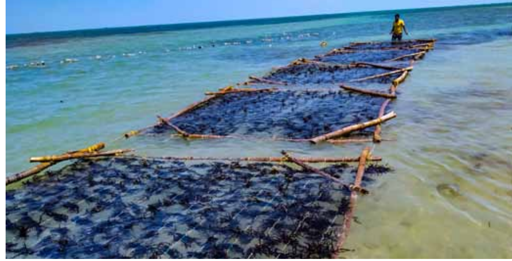
Floating bamboo rafts in the sea