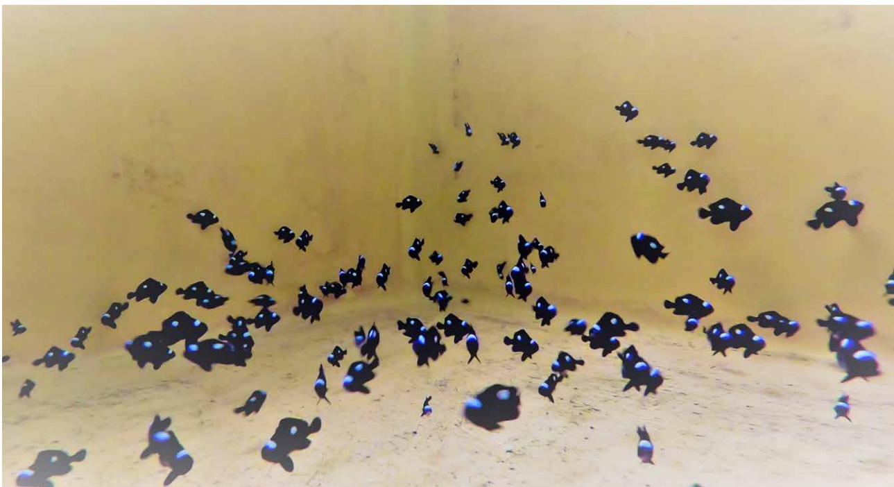
Fig.4. Mass produced juveniles of Three spot damselfish through captive breeding

the protocols mentioned above (Fig.4). Salient features noticed during the entire life cycle was the differential growth due to which smaller juveniles were attacked by the bigger ones, thereby reducing the survival rate. Hence, size grading is very important for ensuring maximum survival. It was also observed that, co-feeding of rotifers from 10 DPH resulted in faster growth and