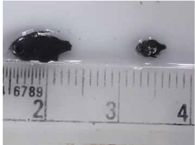
Fig.3. Size variation observed on 41 DPH; Live feed used: Copepod & Artemia nauplii