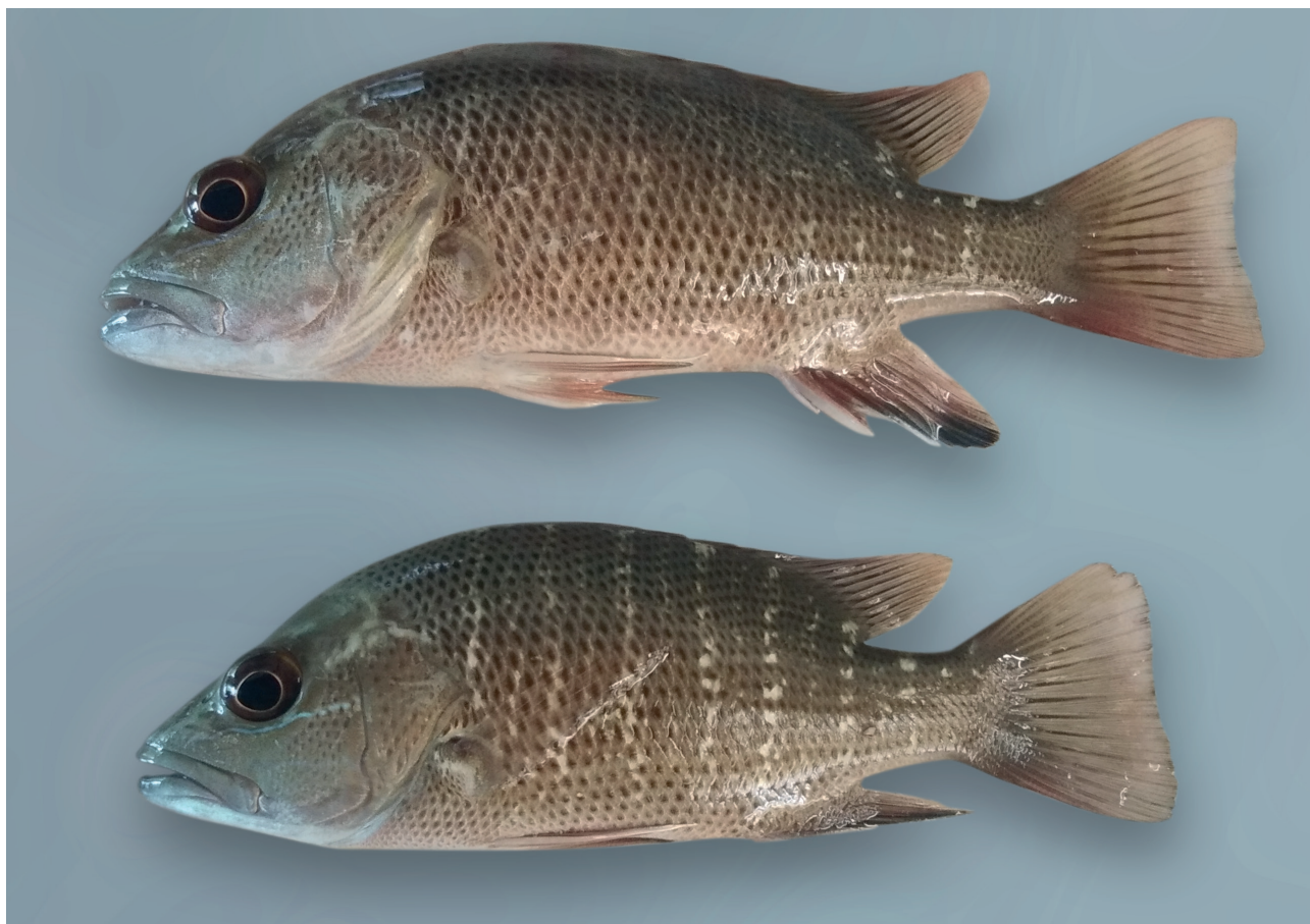
Fig. 2. Normal (top) and stunted (bottom) L. argentimaculatus fingerlings

To standardise the stocking density of mangrove red snapper Lutjanus argentimaculatus fingerlings for stunting trials, experiments were conducted at Calicut Research Centre of ICAR-CMFRI. Red snapper fingerlings (wild collected) were stunted for 30 days at different stocking densities (@ 25, 50, 75 and 100 numbers / m 3 ) providing low value fish as feed at 5 % of body weight. The results indicated that high stocking density stunting is not possible in red snapper fingerlings due to aggressive behaviour of the fish. The ideal stocking density observed was 50 numbers per m 3 for stunting L. argentimaculatus fingerlings.