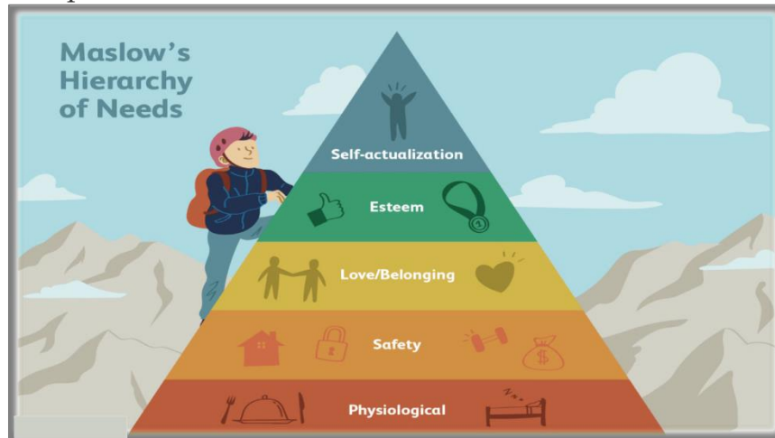
Fig1: Maslow's hierarchy of needs

of hierarchy of needs is portrayed in the shape of a pyramid with fundamental needs at the bottom and the need for self-actualization at the top.