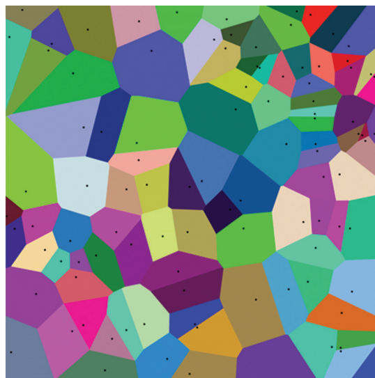
Fig. 1. A Voronoi Polygon map

The nearest neighbours (NN) method draws perpendicular bisectors between sample points (n), predicting the values at the unsampled regions. The resultant polygons are called as Thiessen or Voronoi polygons. All the area inside each polygon will have same value, which is the value of the midpoint of the polygon.