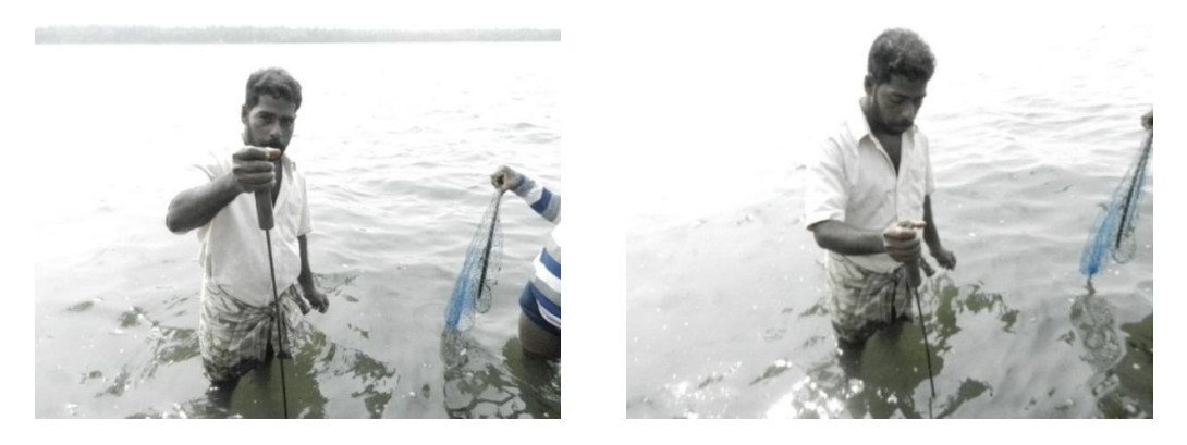
Fig. 3. Use of crab piercer by fishermen