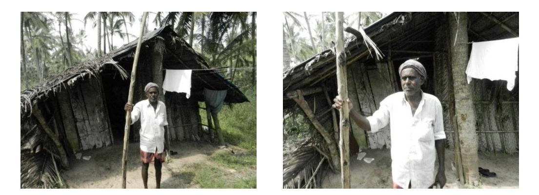
Fig. 4. A fisherman with a "Challam"