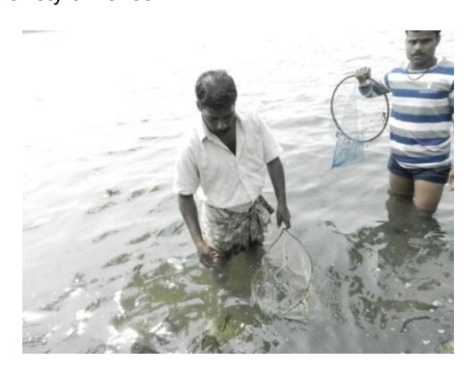
Fig. 2. Komma in operation