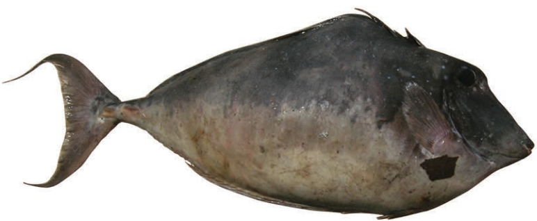
Naso brachycentron (Valenciennes, 1835) Humpback unicornfish