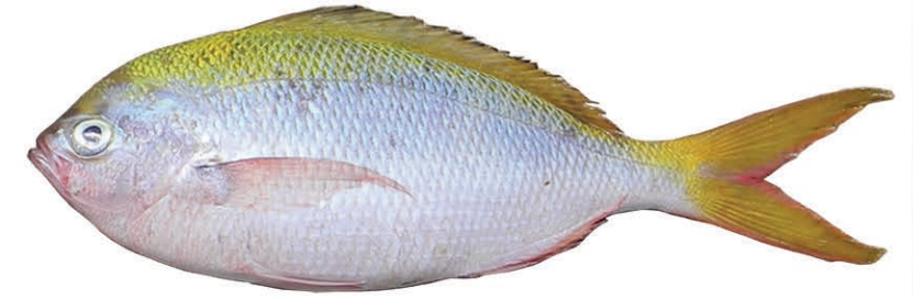
Caesio cuning (Bloch, 1791) Redbelly yellowtail fusilier