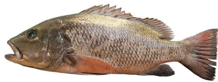
Lutjanus argentimaculatus (Forsskål, 1775) Mangrove red snapper