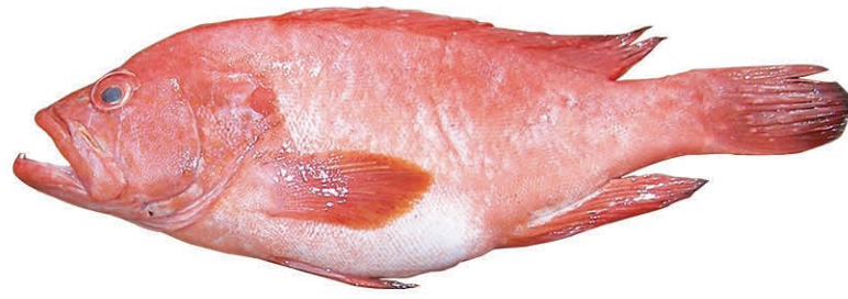
Cephalopholis sonnerati (Valenciennes, 1828) Tomato hind