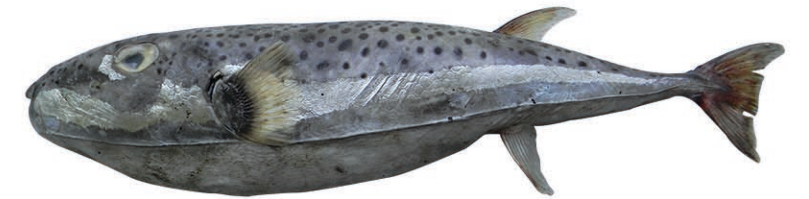
Lagocephalus sceleratus (Gmelin, 1789) Silver-cheeked toadfish