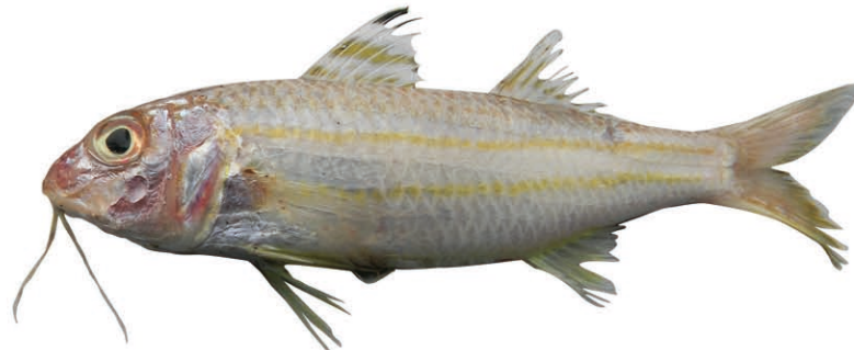
Upeneus sulphureus (Cuvier, 1829) Sulphur goatfish