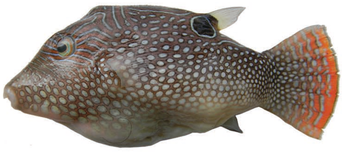
Canthigaster solandri (Richardson, 1845) Spotted sharpnose