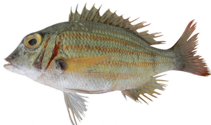
Lethrinus ornatus (Valenciennes, 1830) Ornate emperor