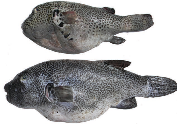
Arothron stellatus (Anonymous, 1798) Stellate puffer