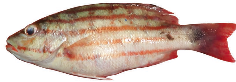
Lutjanus decussatus (Cuvier, 1828) Checkered snapper