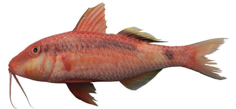
Parupeneus macronemus (Lacepède, 1801) Long-barbel goatfish