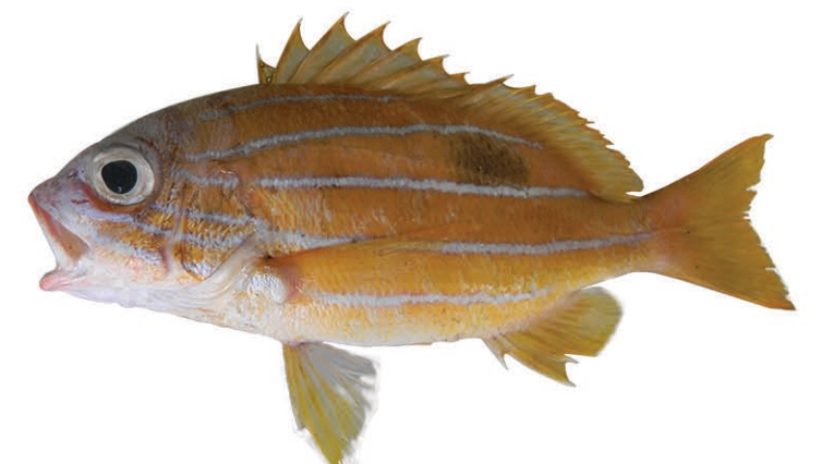
Lutjanus quinquelineatus (Bloch, 1790) Five-lined snapper