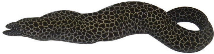
Gymnothorax favagineus (Bloch Schneider, 1801) Laced moray