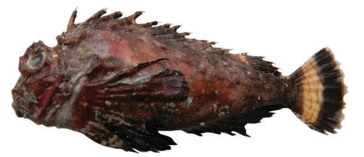
Choridactylus multibarbus Richardson, 1848 Orangebanded stingfish