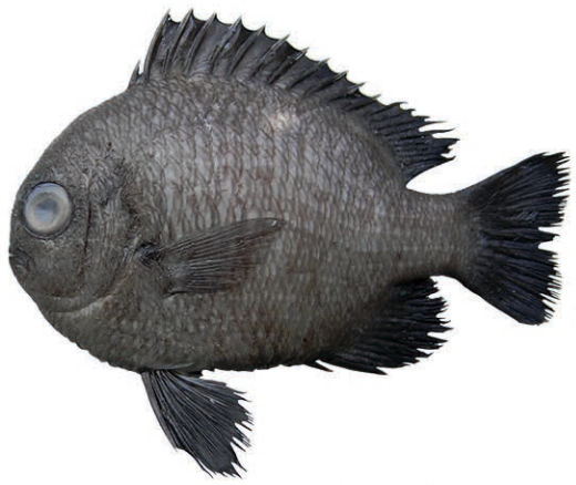
Dascyllus trimaculatus (Rüppell, 1829) Threespot dascyllus