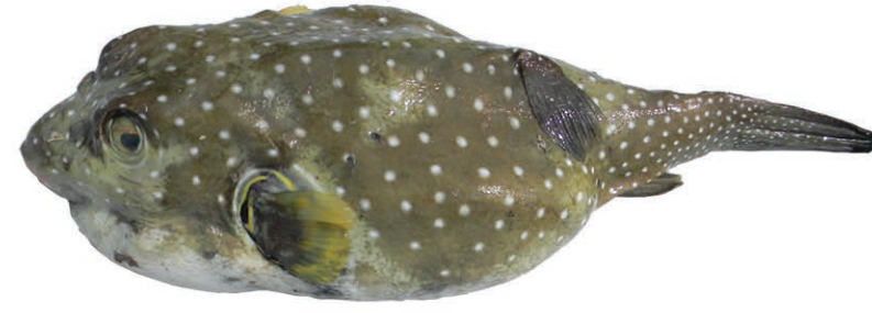
Arothron hispidus (Linnaeus, 1758) White-spotted puffer