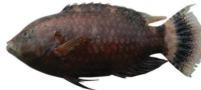
Cheilinus trilobatus Lacepède, 1801 Tripletail wrasse