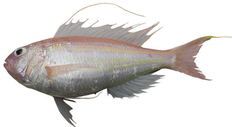
Nemipterus nematophorus (Bleeker, 1854) Doublewhip threadfin bream