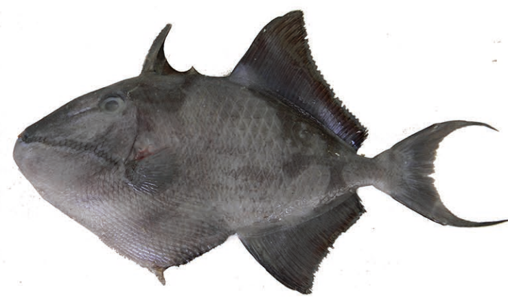
Odonus niger (Rüppell, 1836) Red-toothed triggerfish