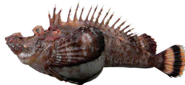
Inimicus didactylus (Pallas, 1769) Bearded ghou