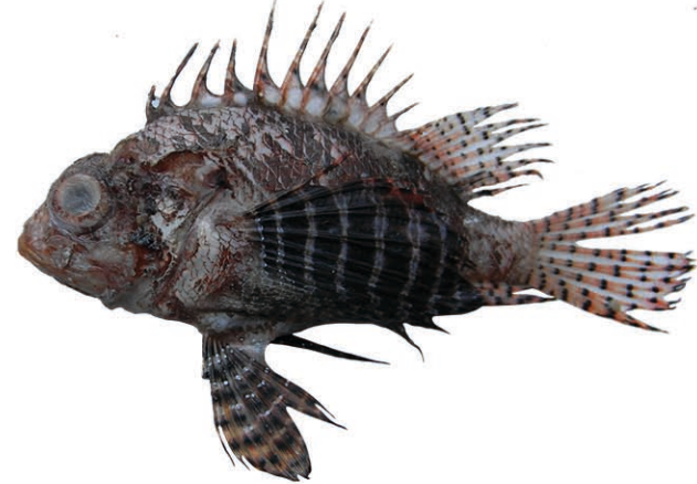
Dendrochirus brachypterus (Cuvier, 1829) Shortfin turkeyfish