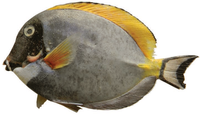
Acanthurus leucosternon (Bennett, 1833) Powderblue surgeonfish