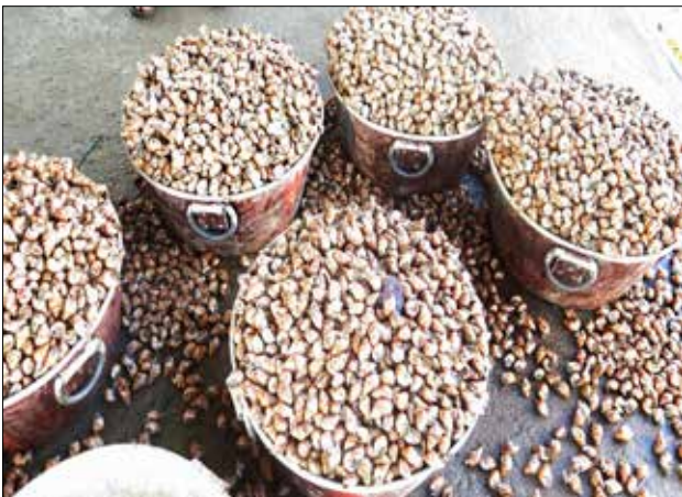
Fig.3. Gastropods set ready to get weighed

Either live or frozen gastropod is exported to various regions around the globe, at an average price ranging from of $2.3 - $3.8 per kg. Gastropods for export as a whole are cleaned and washed several times in water and the processed gastropods are packed in bags totalling 30 kg each. One kilo of gastropods will yield almost 200-300 grams of meat. However, nowadays the gastropod meat exporting companies are rare. The companies were exporting frozen meat and the remaining shells were sent to various shell craft industries in Tamil Nadu, Pondicherry and Goa. But now, these companies are concentrated in exporting the whole gastropod either frozen or alive. The B. zeylanica , which is landed in huge quantities in the Kollam harbours are the main frozen gastropod and are exported at an average rate