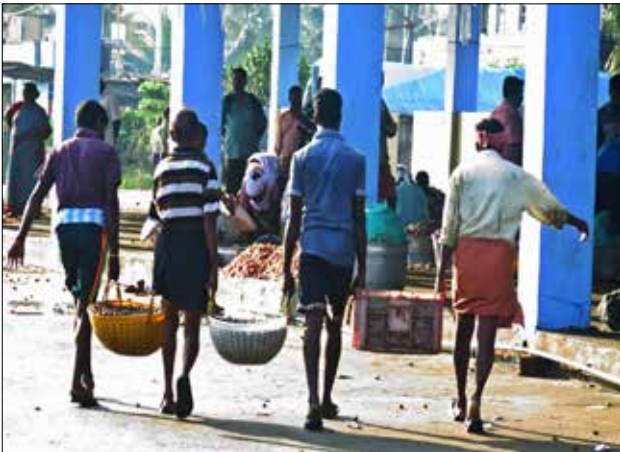
Fig.2. Gastropods carried to the weighing centre

separated and weighed onsite. The gastropods are taken to the nearby exporting companies where they are cleaned and processed. No middlemen work in between the fishermen and the exporting companies. Fig. 2 and 3 depicts the gastropods being carried for weighing at the landing centre and set ready for weighing, respectively.