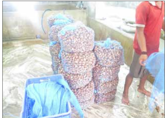
Fig.4. Gastropods washed and packed at an exporting company of Kollam

of $2.3 per kg, whereas Babylonia spirata is exported alive at a price ranging up to $3.8 per kg. Fig. 4 shows a gastropod exporting company in Kollam.