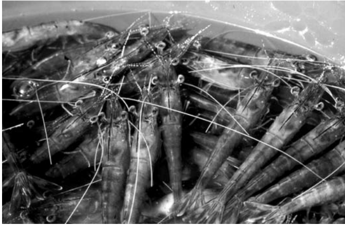
Fig. 3. Harvest of P. indicus from the liner ponds.