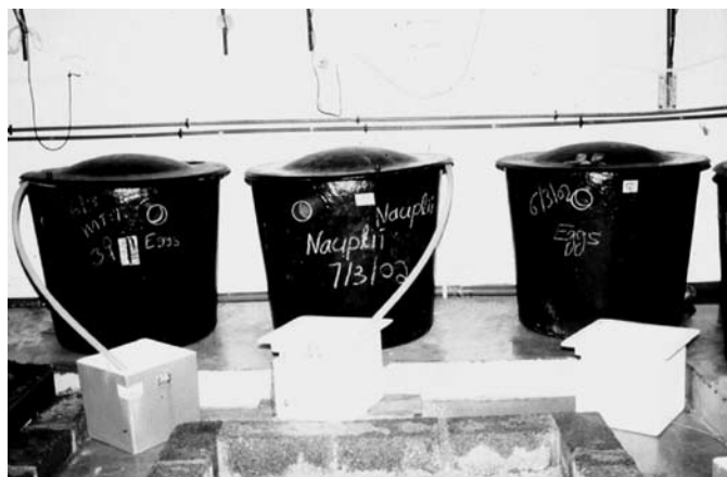
Fig. 1. Harvesting of shrimp nauplii in 30-l harvesting buckets from the 400-l hatching black fiberglass tanks.

This first trial involved the culture of locally hatchery-bred 49 day-old postlarvae (PL 49 ) of the Indian white shrimp, P. indicus , in a 1 ha tidal pond situated along one of the artificially dredged channels for 113 days. Final average body weight was 20.17 g, with a survival rate of 72 percent and feed conversion ratio of 2.0. The shrimp were found to mature under pond conditions and, hence, provided a continuous supply of broodstock (Al Ahbabi et al. 2000, Yousif et al. 2000). The findings have encouraged