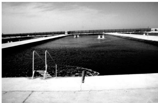
Fig. 2. 0.25 ha grow-out liner ponds for P. indicus in Abu Al Abyad island.

further trials on the culture of this species on the island. Results of the second pilot hatchery and pond production trials conducted during the 2001 season are reported here.