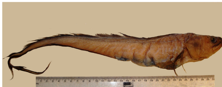
Fig. 1 Lateral view of the specimen Pyramodon lindas (Markle & Olney, 1990) collected from Indian sea

Lightly coloured with the exception of the dorsal and anal fin margins which are quite dark head and body are generally unpigmented. There is an unpigmented patch on the cheek that over lies the adductor mandibulae.