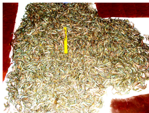
Fig. 3. Harvested P. monodon from open sea floating cage

After 99 days of culture, as growth did not progress much, the stock was harvested on the day 100. The total shrimp harvest was about 207 kg. The computed FCR and production rate were 3.97 and 1.62 kg m -3 respectively. The harvested shrimp count was 228 per kg and survival percentage at the time of harvest was 31.4. Harvested size of shrimp was 81.54±15.20 mm TL/4.50±2.80 g wt. Harvested size for male was 79.38±17.67 mm/4.19±2.92 g and for female it was 82.52±13.89 mm/ 4.65±2.75 g (Fig. 3). Length frequency of harvested P. monodon is given in Table 6. The total length range was 55 - 120 mm for males and 55-117 mm for females. Among the harvested shrimp, about 63% of males and 60% of females were below 85 mm total length, resulting in 61.3% of total harvested animals being below 85 mm total length. Though harvested