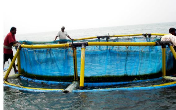
Fig. 1. View of 6 m dia cage installed in the Bay of Bengal for culture of P. monodon

dia pipe, was fixed in between two rings, slightly close to the outer ring for the catwalk. A 6 m dia (fourth) ring made of 90 mm pipe was fixed to the base rings at a height of 1 m by connecting all 8 pieces of 250 mm dia pipes by 8 vertical and 8 tangential pipes of 90 mm dia (Fig. 1).