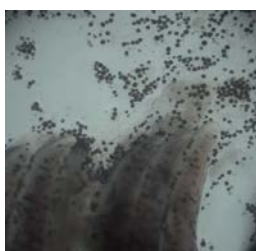
Fig. 1. Wet mount of silver pompano gills showing trophonts and detached tomonts of A. ocellatum

The infected fish showed signs of distress, loss of appetite and flashing behaviour. The body of silver pompano infested with A. ocellatum appeared thin and emaciated. Grossly, focal areas of erosion were seen on the operculum. Gills of infected fish showed excessive mucus and pale discoloration. It is presumed that fish died due to severe erosion of gill membranes hampering gaseous exchange. Microscopic examination of the gill filaments showed distended appearance with the presence of feeding stage trophonts, dark-brown in colour mechanically lodged between the gill filaments (Fig. 1). Dislodged trophonts were also observed between the gill lamellae and on the fin surface (Fig. 2). Histopathologically, the gill filaments showed hypertrophy of the secondary lamellae with the presence of inflammatory cells around the trophonts (Fig. 3). Secondary lamellae showed focal necrotic changes. In histological sections trophonts were also seen inside the gill arch and tissues (Fig. 4). Internal organs showed generalised congestion. The cysts collected from the rearing tank water were also confirmed as tomonts of A. ocellatum .