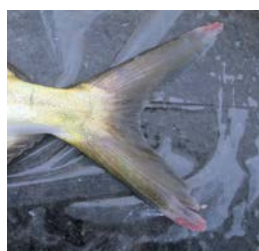
Fig. 2. Caudal fin of silver pompano showing erosion due to A. ocellatum infestation