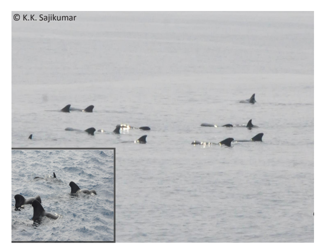
Image 8. Pilot whale pod show resting activity (Logging). Entire pod. (inset) close-up of four animals.