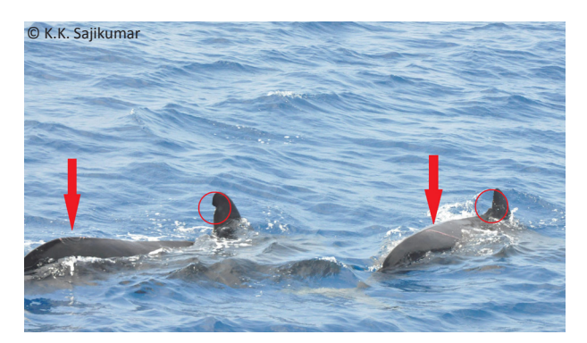
Image 12. Whale body had notch and injuries. Arrow marks indicate injuries and circle indicate notches.

(1973). Mass stranding of Pilot Whales in the Gulf of Mannar. Indian Journal of Fisheries 20(1): 269–279.