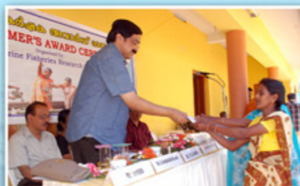
Presentation of Award to SHG leader

eprints@cmfri - the largest open access repository of marine fisheries in the world.