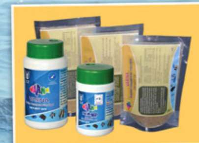
VARNA: The Marine Ornamental Fish Feed