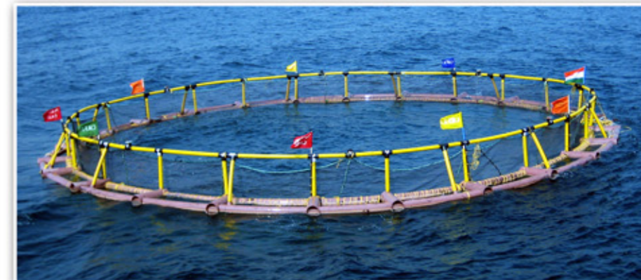
Open sea cage

To develop an integrated Marine Fisheries Management Policy to sustain the marine fisheries and augment production through open sea farming and protect the nursery grounds and habitats.