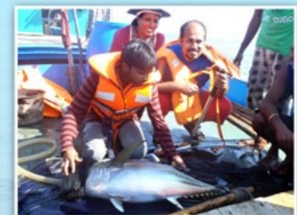
Pop Up Satellite Tagging of Yellowfin Tunas