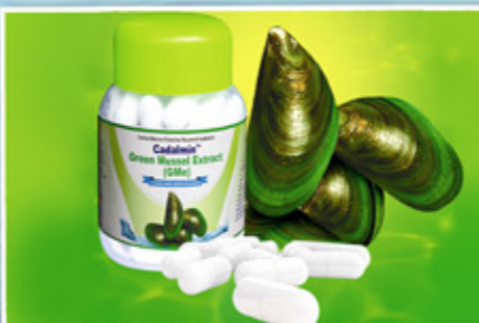
Green Mussel extract (GMe)