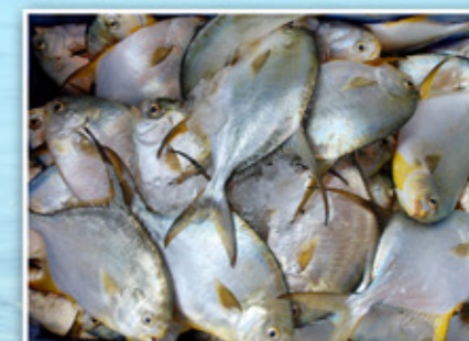
Harvested Pompano from cage