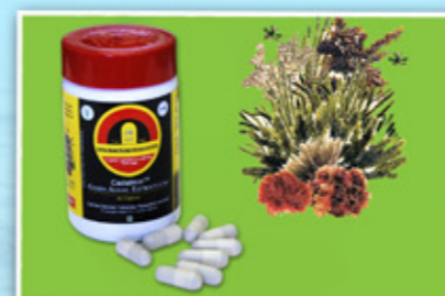
Green Algal extract (GAe)